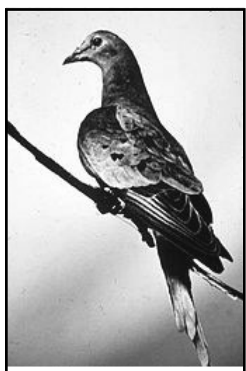
Martha's body was frozen into a block of ice and sent to the Smithsonian Institution, where it was skinned, dissected, photographed and mounted. Currently, Martha is in the museum's archived collection and not on display. A memorial statue of Martha stands on the grounds of the Cincinnati Zoo.

The Passenger Pigeon was an excellent flyer, and is estimated to have averaged 62 mph during migration. At roosting sites the Passenger Pigeons packed so densely on branches that even thick ones often broke under their collective weight.