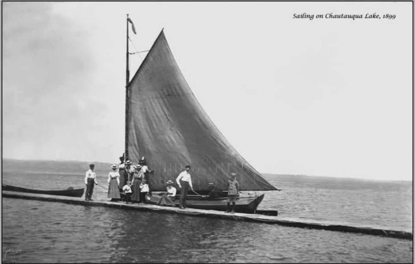
Sailing on Chautauqua Lake, 1899

Bradford Landmark Society 45 East Corydon Street Bradford, PA 16701